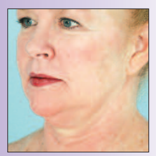
Submental area before Tx