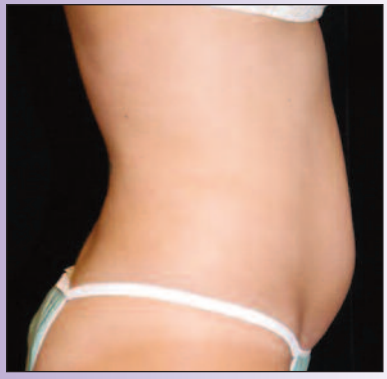
Abdomen before Tx

"ProLipo PLUS with TempASSURE allows physicians for the first time to have a quantitative clinical endpoint for melting fat and firming tissue."