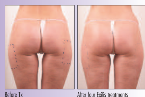
Before Tx