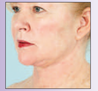
Submental area one month after Smartlipo MPX Tx