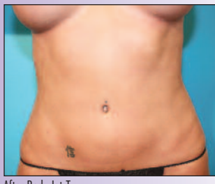
After Body-Jet Tx

In 2008, more than 8 million body shaping procedures were performed worldwide, earning physicians over $2.8 billion in fees. By 2013, this will rise to more than 13 million treatments earning $5.6 billion. Additionally, 670,000 skin tightening procedures were performed worldwide, earning physicians almost $970 million in fees. By 2013, this will expand to almost 2 million treatments earning them $2.3 billion.