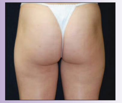
After SmoothShapes Tx

"In just a single session with Med Contour, the circumference of the treated area is visibly reduced and the skin is immediately given a smoother, more toned appearance."