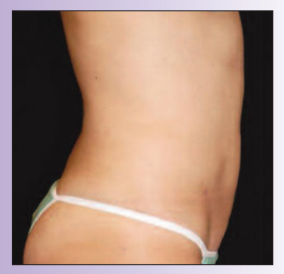
Abdomen after ProLipo PLUS Tx

and enhances procedure safety, offering less bruising and swelling along with more precise results, particularly on more delicate areas of the face and body. As of October 2009, FDA approval was pending.