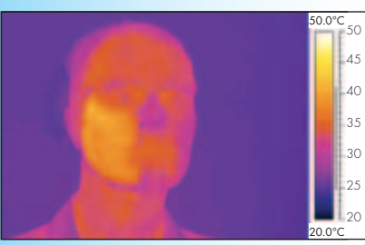
Thermal photography shows a uniform heat profile of 42° C on the lower right facial zone after four minutes of Fractora Firm

R. Stephen Mulholland, M.D., F.R.C.S.(C) Owner SpaMedica Infinite Vitality Clinics Toronto, Canada